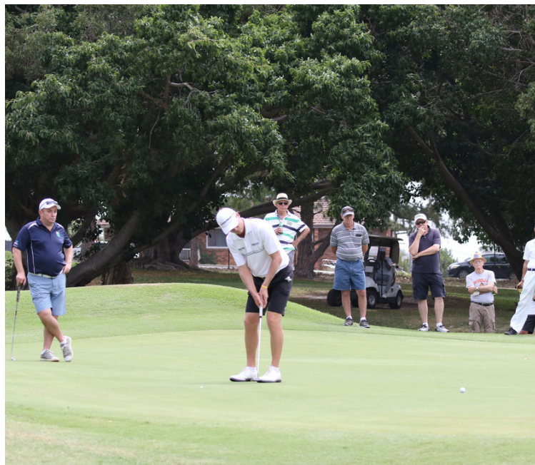
Host of Australia's richest one day Pro-Am (6th green)

To find out more about joining Wynnum Golf Club, including information regarding fees, payment options and any conditions applicable to a particular membership category, please contact the Club on 3396 9000, or email membership@wynnumgolf.com.au