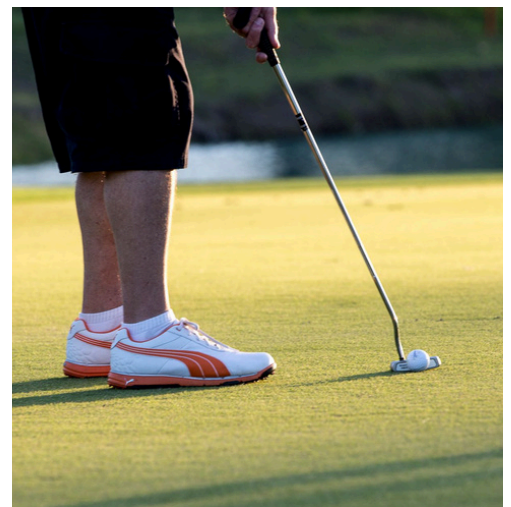
Bermuda greens which are over sown for the winter months.

Contact the Club reception on 3396 9000, or email membership@wynnumgolf.com.au