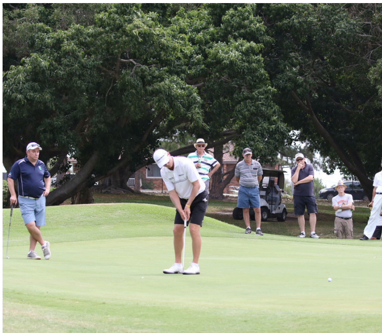
Host of Australia's richest one day Pro-Am (6th green)

To find out more about joining Wynnum Golf Club, including information regarding fees, payment options and any conditions applicable to a particular membership category, please contact the Club on 3396 9000, or email membership@wynnumgolf.com.au