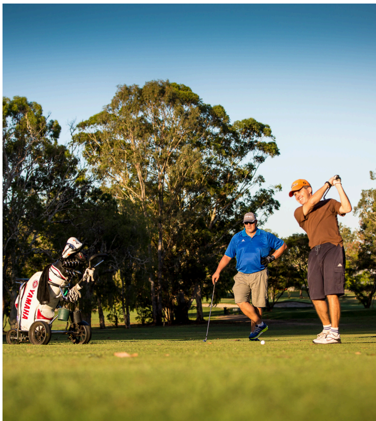
Pristine blue couch fairways (14th hole)