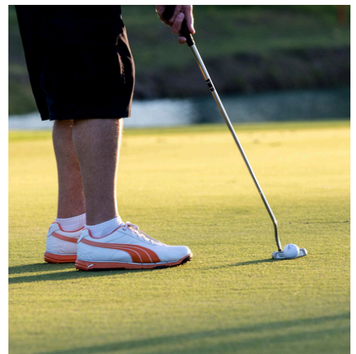
Bermuda greens which are over sown for the winter months.

Contact the Club reception on 3396 9000, or email membership@wynnumgolf.com.au