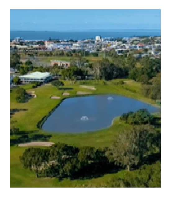
Aerial view of our charming Federation Style Clubhouse, 9th and 18th greens nestled in Brisbane's Beautiful Bayside.