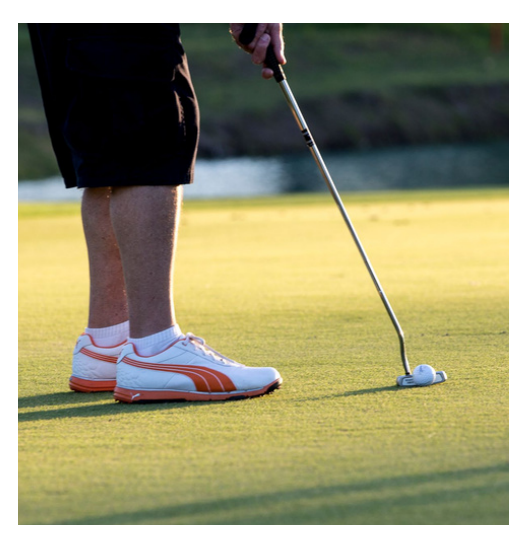
Bermuda greens which are over sown for the winter months.

Further Information Contact the Club reception on 3396 9000, or email membership@wynnumgolf.com.au