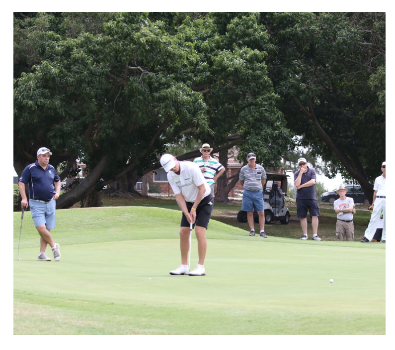
Host of Australia's richest one day Pro-Am (6th green)

A credit to the member House account equivalent to 5% of membership fee component is available upon application for family members sharing the same residential address.